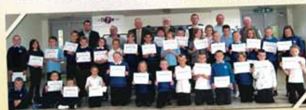
BENFIELD SIDE PRIMARY SCHOOL