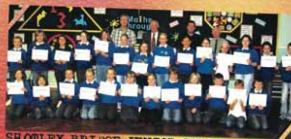
SHOTLEY BRIDGE JUNIOR SCHOOL