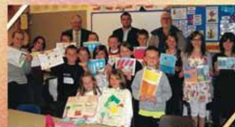
ST MARYS RC PRIMARY SCHOOL