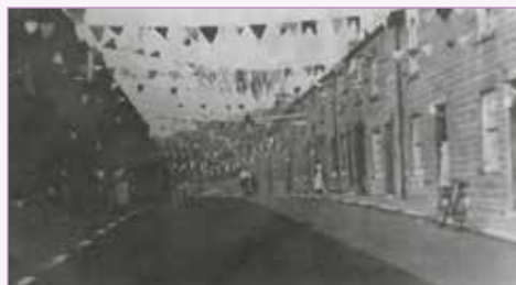
Wood Street decorations after the 1914-1918 war.